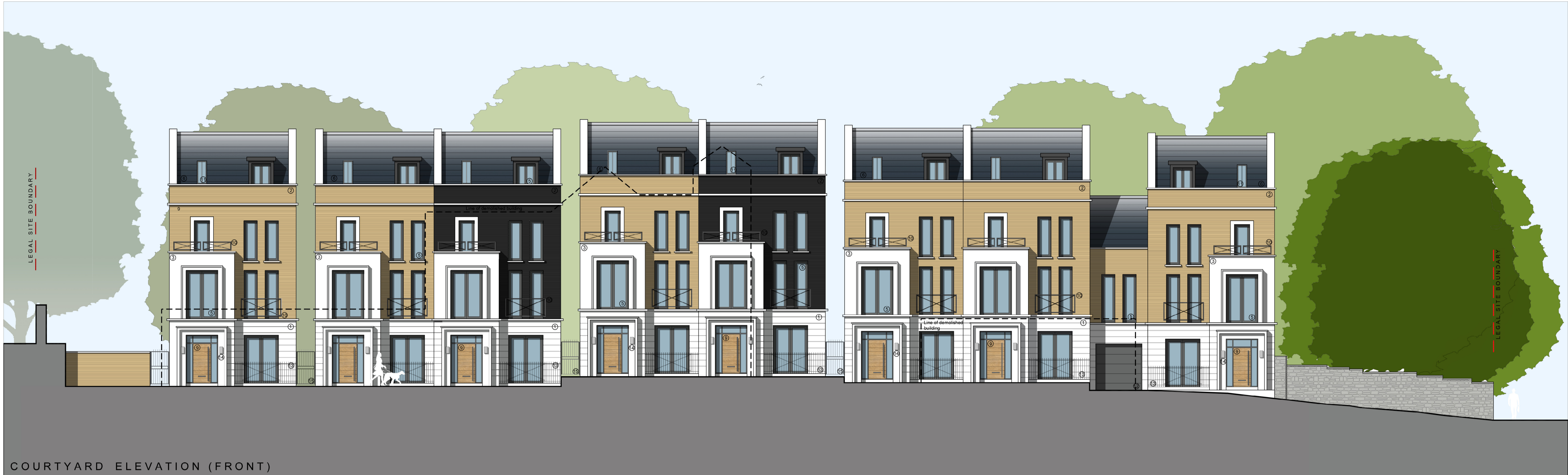
COURTYARD ELEVATION (FRONT)