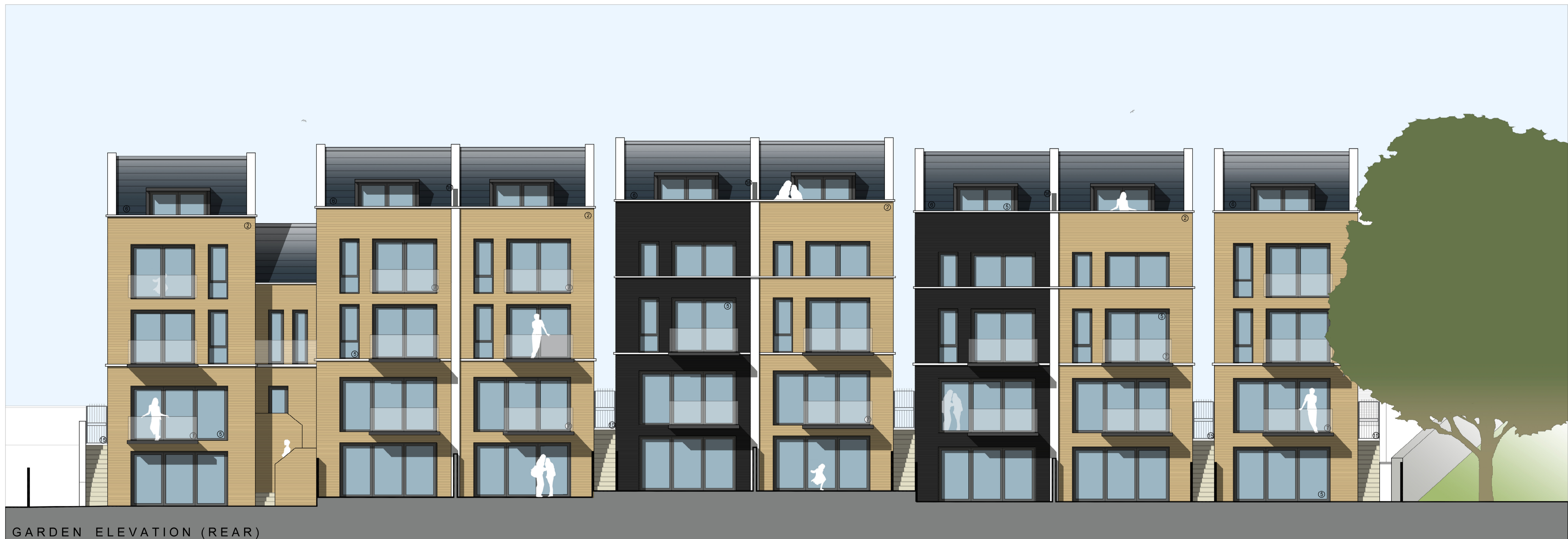
GARDEN ELEVATION (REAR)