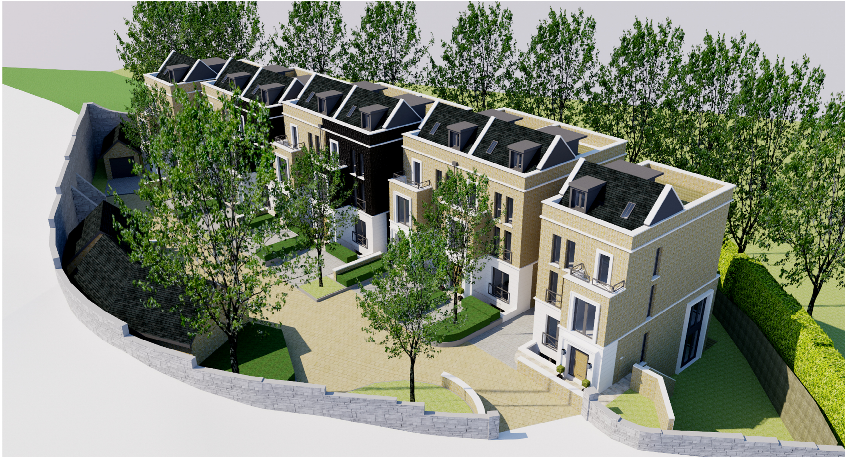
Semi aerial view of the development